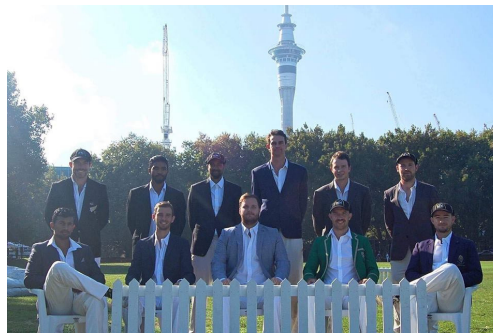
(Above) Our Premier team sharply dressed in a nod to tradition and the 'Spirit of Cricket'

This Saturday sees a reunion of these Grafton stalwarts at Victoria Park with past players sharing their reflections of the era.