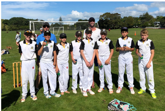
Above: Our winning Y8 LO team